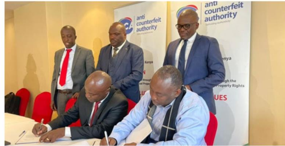
Kenyan counterfeit Authority officials sign an MOU with Directors of the Anti- Counterfeit Network - Africa.